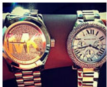
Must Have Michael Kors Watches are Being Sold for Next to Nothing QuiBids