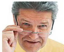
The 19 Must Have Stocks in 2014 Newsmax