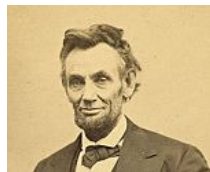
You Won't Believe Who's Related to Abraham Lincoln Ancestry.com